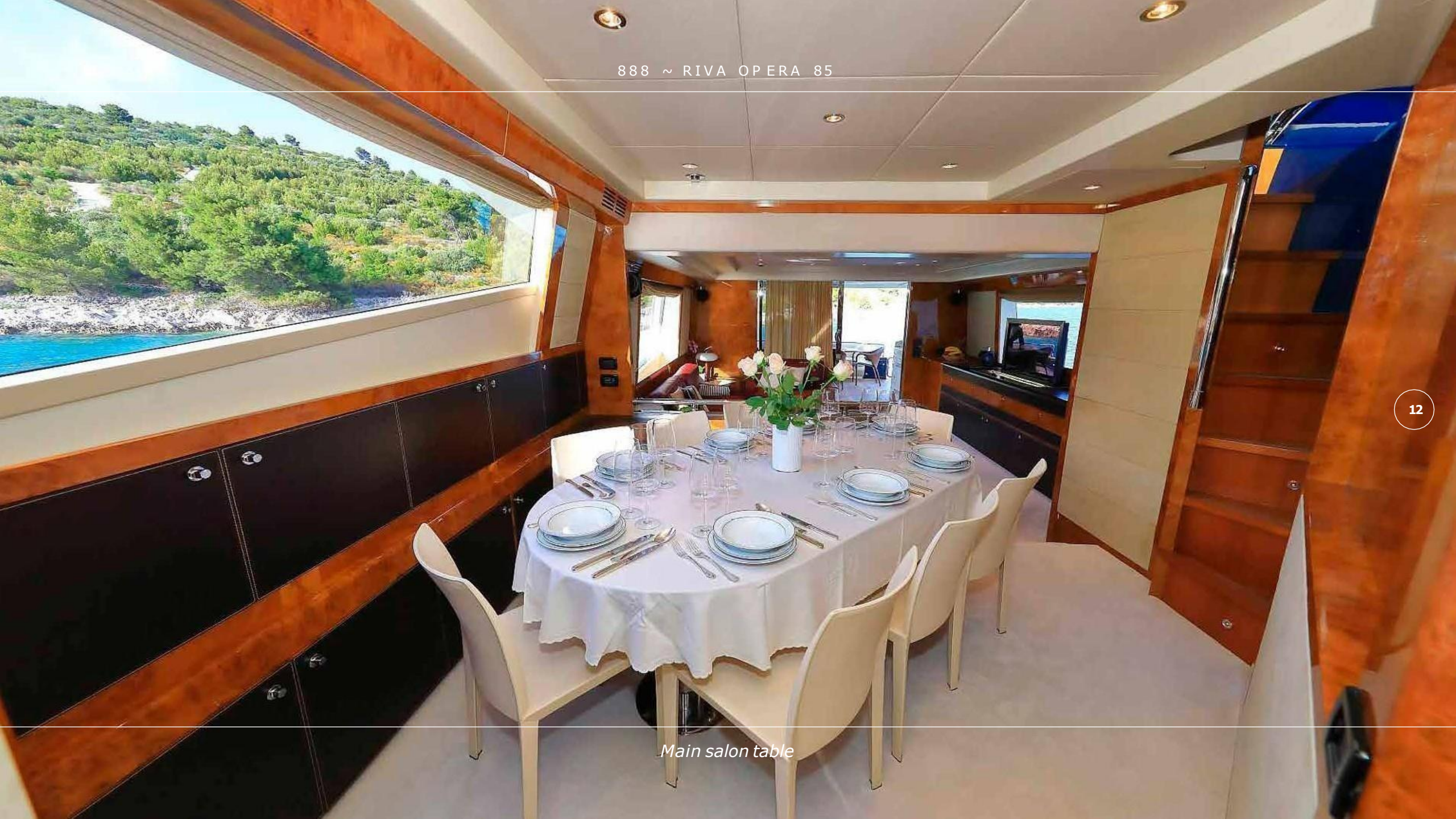
Main salon table