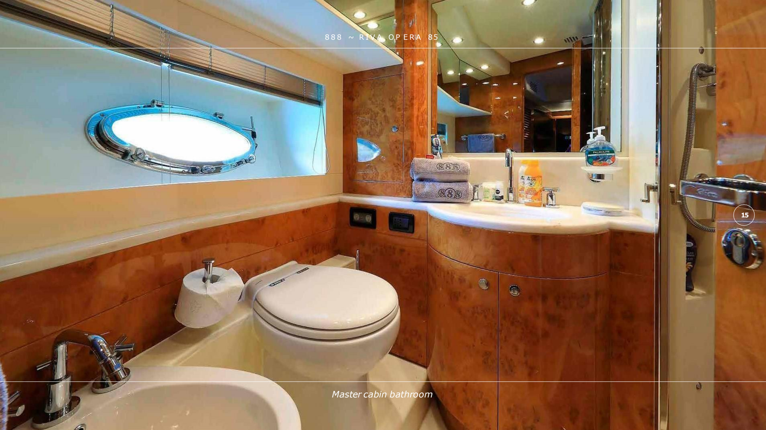
Master cabin bathroom